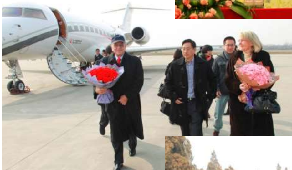
Honouring Putzmeister we got flowers wherever we arrived – here in Changsha, 2 flight hours south of Beijing with SANY Plane

Demonstration at the Buddhist SHAOLIN Temple to in future fight for excellence and against the evil and human stupidity only with spiritual and emotional weapons. This shall in our modern open world become more effective as old killing tools like those in its visitor's park. KS here symbolizes to help cut antiquated ideologies, customs and attitudes, and false opinions specially in the western world about modern China - also in Germany