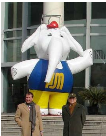
<<<The Elephant in front of TONGJI.

The Elephant became in China the symbol for concrete pumps in the early years when PUTZMEISTER – Elephant pumps made the concrete pumping method popular in China.